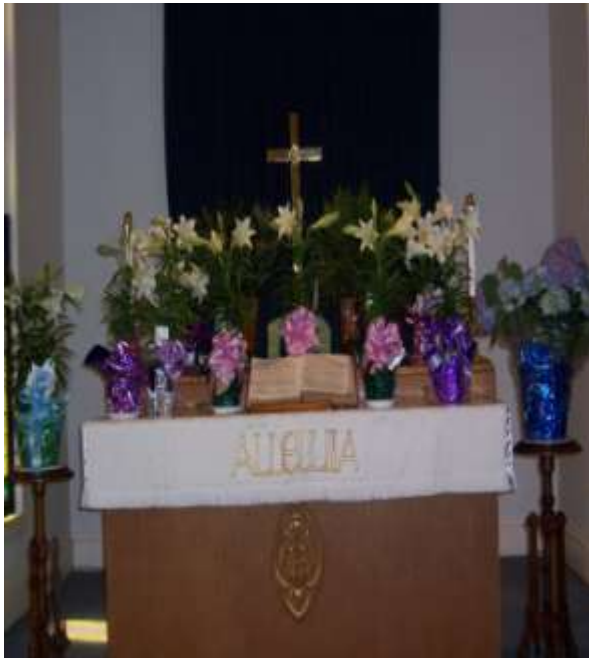
Easter Sunday Altar Flowers, 2014