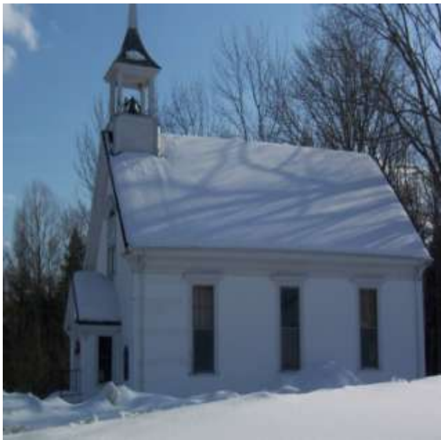
St. Paul’s Chapel, Dutch Neck, Waldoboro